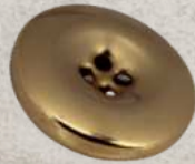
art 1070 lin 20, 24, 28, 32, 36, 40