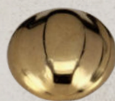
art 1045 lin 20, 24, 28, 32, 36