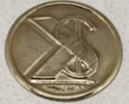
art 1054 lin 20, 24, 36