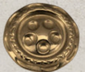
art 1036 lin 20, 24, 28, 32, 36