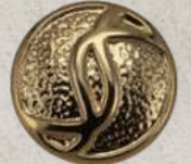
art 1090 lin 20, 28, 36