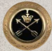
art SMB 1040 S lin 24, 32