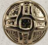
art 1086 lin 20, 28, 36