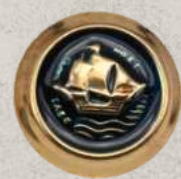
art SMB 1043 lin 20, 24, 28, 32, 36