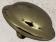
art 1074 FE lin 20, 24, 28, 32, 36, 44