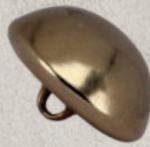
art 1003 FE lin 16, 18, 24, 28, 32, 36, 40