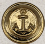
art 1038 lin 20, 24, 28, 32, 36