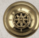
art 1005 lin 20, 24, 28, 32, 36, 40, 44