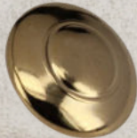
art 1011 FE lin 22, 28, 36