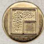
art 1100 FE lin 24, 32