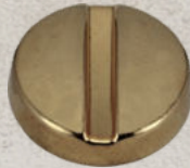
art 1023 lin 22, 24, 28, 36