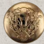
art 1109 lin 24, 40