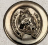
art 1034 lin 20, 24, 28, 32, 36