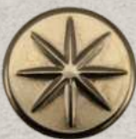
art 1099 lin 20, 24, 32