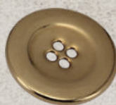
art 1039 lin 20, 24, 28, 32, 36