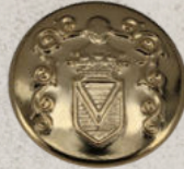
art 1025 lin 24, 32, 36