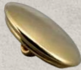
art 1051 FE lin 12, 18, 20, 24, 28, 32, 36, 44