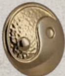
art 1092 FE lin 20, 28, 36