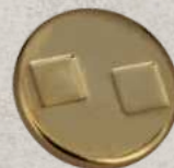
art 1097 lin 20, 24, 28, 32