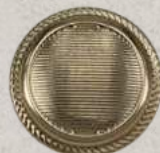
art 1126 lin 24, 28, 32, 36