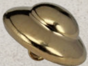
art 1028 lin 22, 24, 28, 36