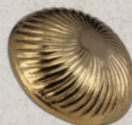
art 1046 lin 20, 24, 28, 32, 36