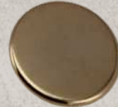
art 1053 FE-OT lin 18, 20, 22, 24, 28, 32, 36, 40, 44