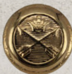
art 1040 FE lin 20, 24, 28, 32, 36