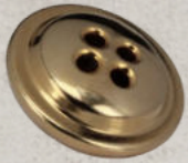
art 1001 lin 20, 24, 28, 32, 36, 40