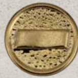
art 1101 FE lin 22, 28, 36, 40