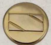
art 1098 lin 20, 24, 28, 32