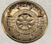
art 1027 lin 22, 28, 32, 36