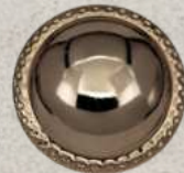
art 1072 FE-OT lin 20, 24, 28, 32, 36, 44