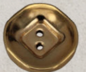
art 1048 lin 24, 28, 32, 36, 40