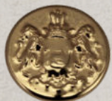
art 1044 lin 20, 24, 28, 32, 36