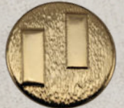
art 1020 lin 20, 24, 28