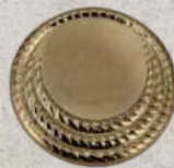
art 1096 FE lin 22, 28, 36