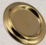
art 1118 lin 36, 40, 42, 44