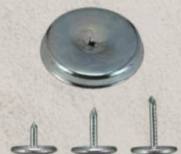
RETRO CON CHIEDO