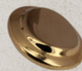
art 1047 FE lin 20, 24, 28, 32, 40