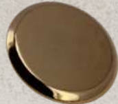
art 1082 FE lin 18, 20, 24, 28, 32, 36, 40