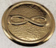
art 1022 lin 22, 28, 36