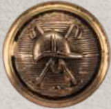
art 1055 lin 20, 24, 28, 32, 36