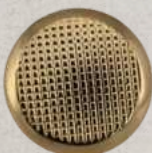
art 1115 OT lin 24, 32