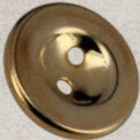
art 1010 FE lin 20, 24, 28