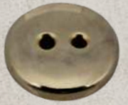
art 1073 lin 18, 20, 24, 28