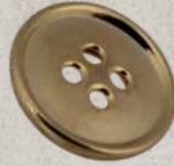
art 1052 FE-OT lin 20, 24, 28, 32, 36, 40, 44