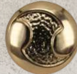
art 1089 lin 20, 28, 36