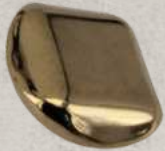
art 1050 lin 20, 24, 28, 32, 36