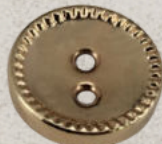
art 1030 FE lin 18, 20, 24, 28