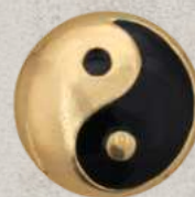
art SMB 1092 lin 20, 28, 36