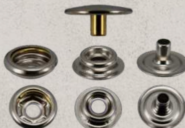
RETRO PER MONTAGGIO CON art 1103