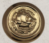
art 1043 FE lin 20, 24, 28, 32, 36