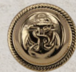
art 1042 FE lin 20, 24, 28, 32, 36