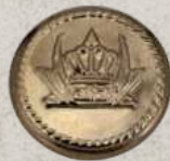
art 1095 lin 32, 40