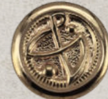
art 1035 lin 20, 24, 28, 32, 36