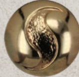
art 1012 FE lin 22, 28, 36