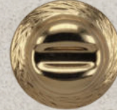
art 1013 lin 22, 28, 36