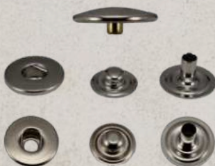
RETRO PER MONTAGGIO CON art 1069