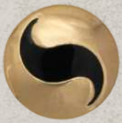
art SMB 1012 lin 22, 28, 36