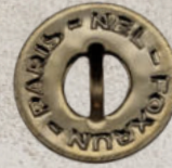
art 1026 lin 24, 28, 36