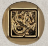
art 1009 lin 24, 32, 36